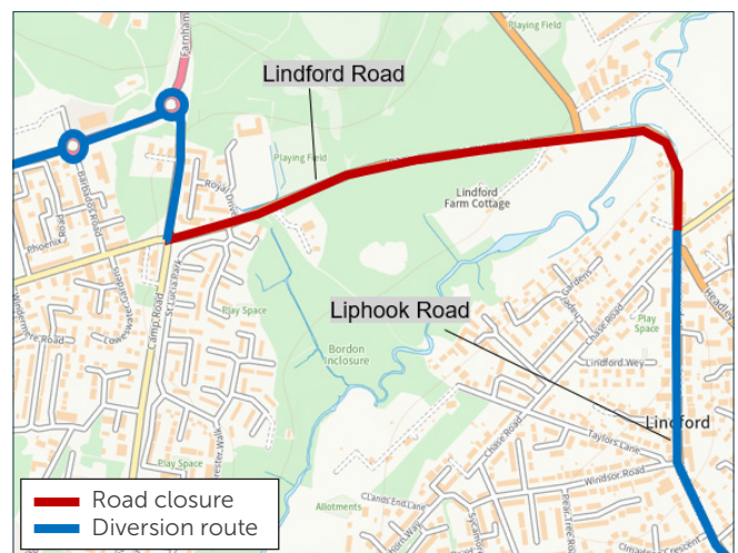
Planned road closure

Whilst we are carrying out this work, we'll aim to keep any noise and disruption to a minimum. There are no planned power cuts scheduled to take place during the works. See map below for the location of the works.