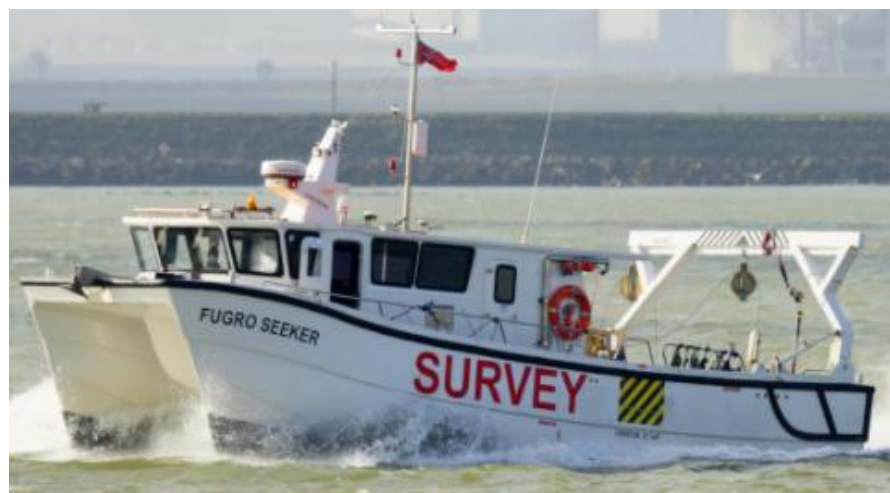
Figure 5: Fugro Seeker