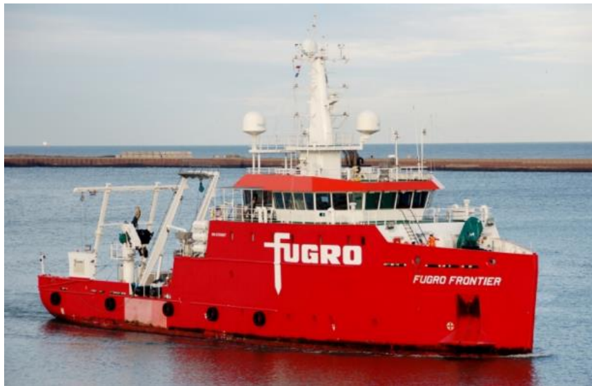
Figure 3: Fugro Frontier

The vessels that will carry out the survey activities are shown below.