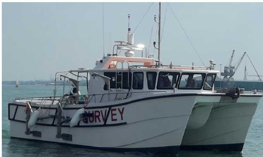
Figure 4: MV Valkyrie